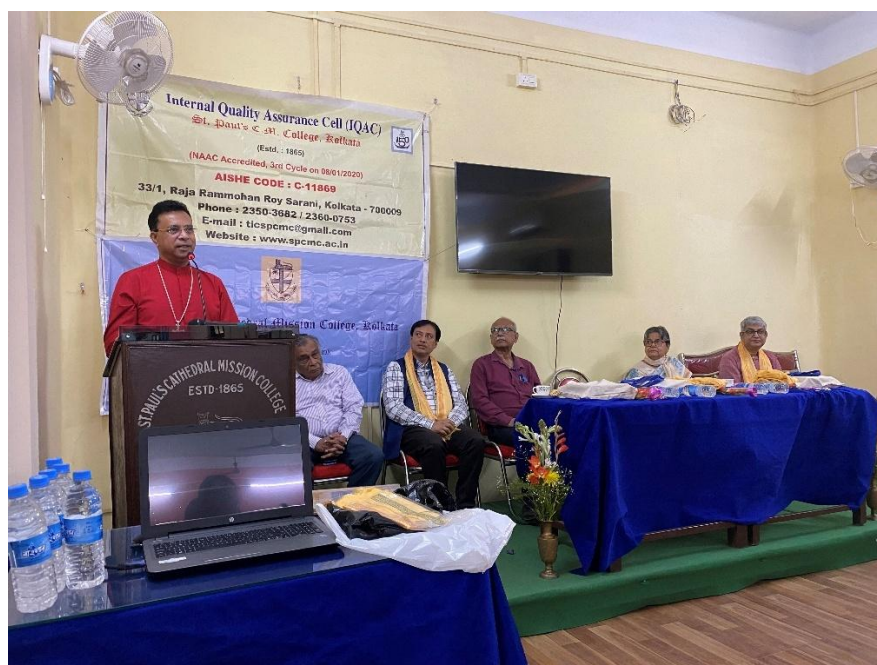
The Rt. Revd. Bishop and the dignitaries on the dais