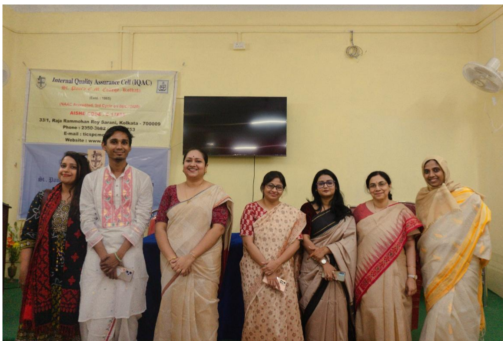
The Department of English