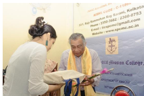
Felicitations to the Rt. Revd Bishop, the Registrar, the Chief Guest and the Secretary of the Governing Body