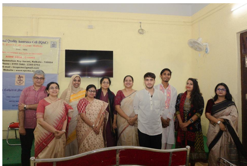
Students and Teachers