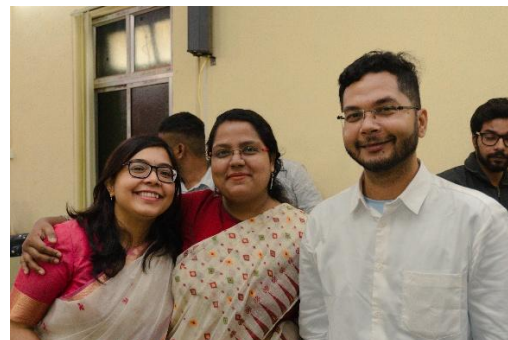
Tea Break and Camaraderie