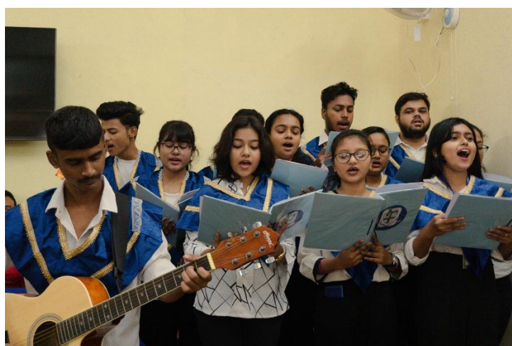
The College Choir