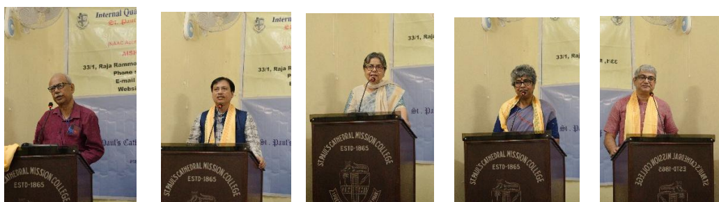
Dignitaries in the Official Session

The programme was divided in two halves – the former being the official session where the dignitaries addressed the audience, and the latter being the academic session where the Chief Guest and the Special Guest addressed our students. In between we had a brief tea-break.