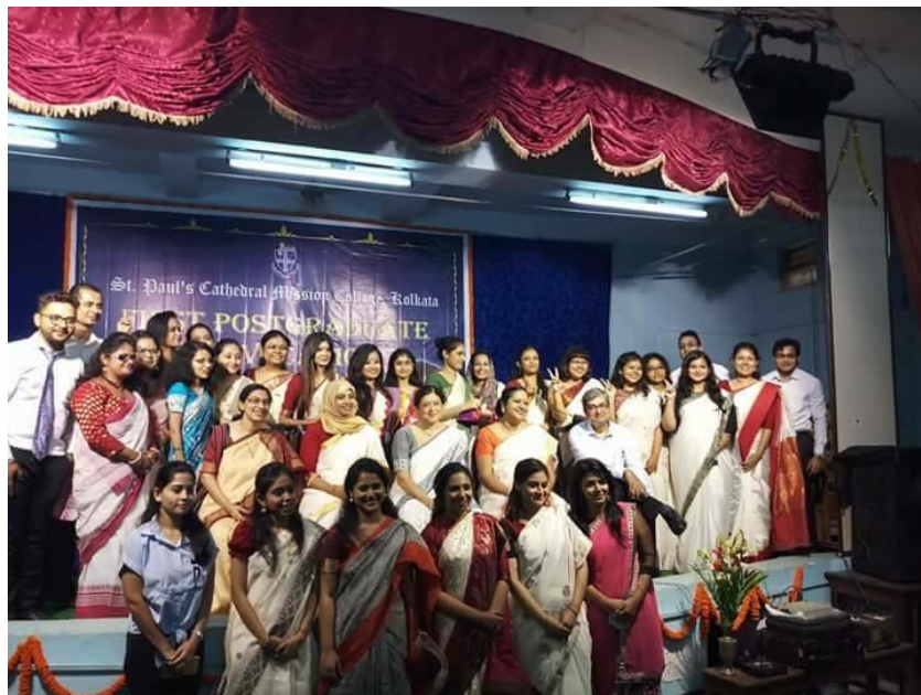
Our proud Students