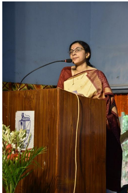
The Dean's Address