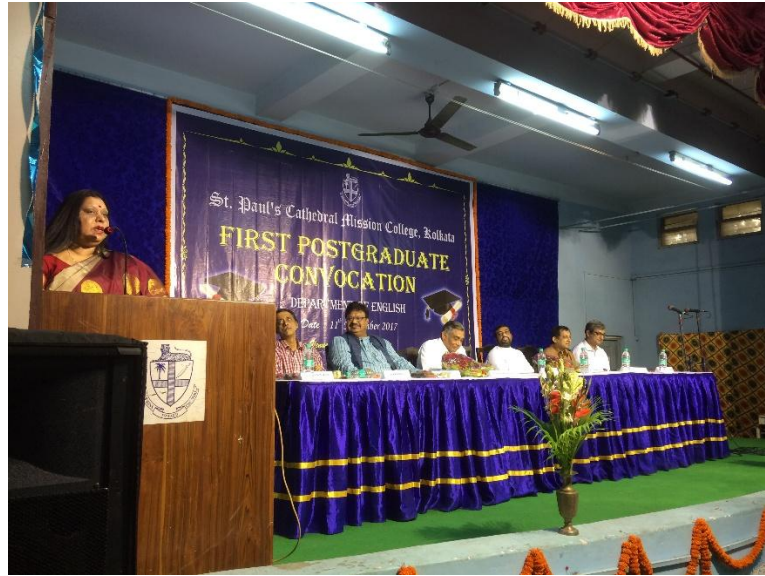
On the Dais