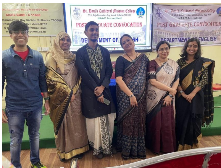
The Department of English