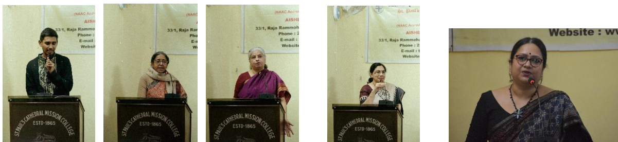
Moments of the Day