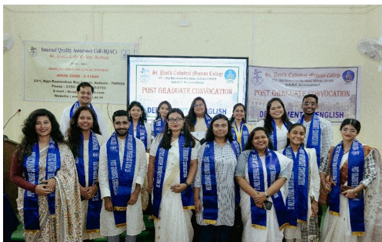
Our Students, Our Pride