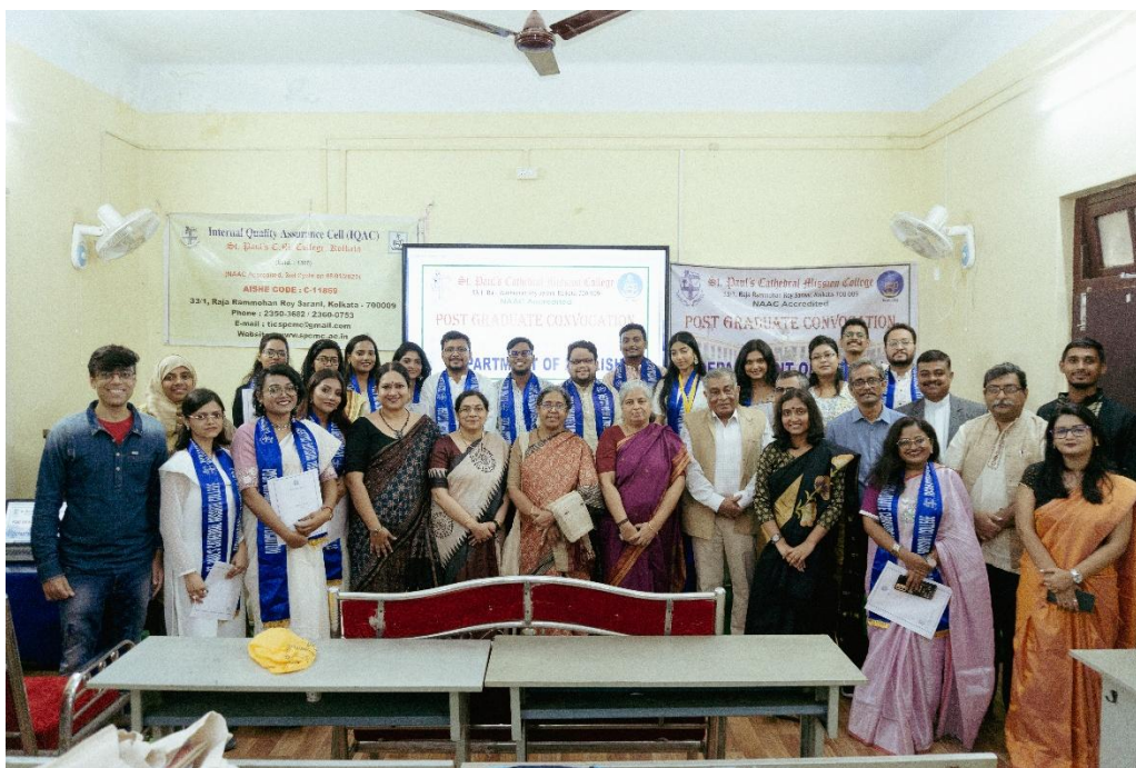
The College Family

A very special word of thanks to the student volunteers for the programme. The small army of fourteen students did everything they were asked to do from ushering the guests, looking after the registration desk, ensuring every body their food packets and the felicitation of the guests. They were also responsible for the wonderful photographs displayed here.