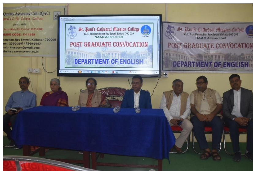
On the Dias