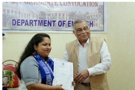
The students receiving their M.A Certificates