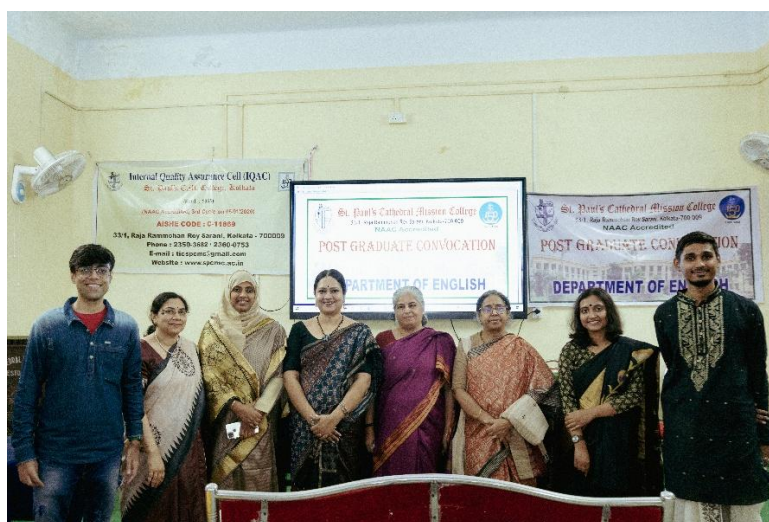
Department of English with the Guests