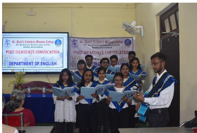
The College Choir