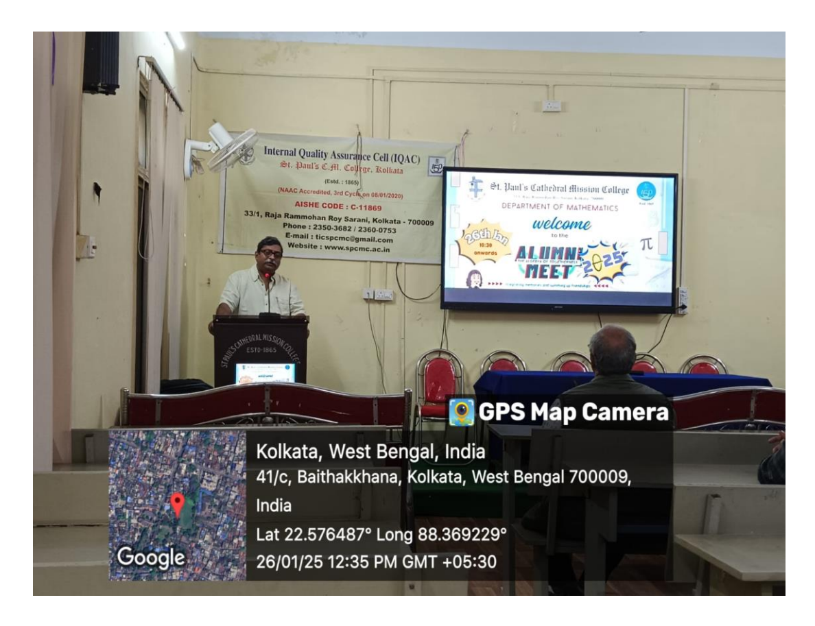
Vice Principal's Speech