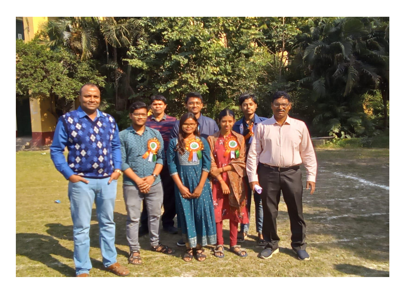
Teachers with present students