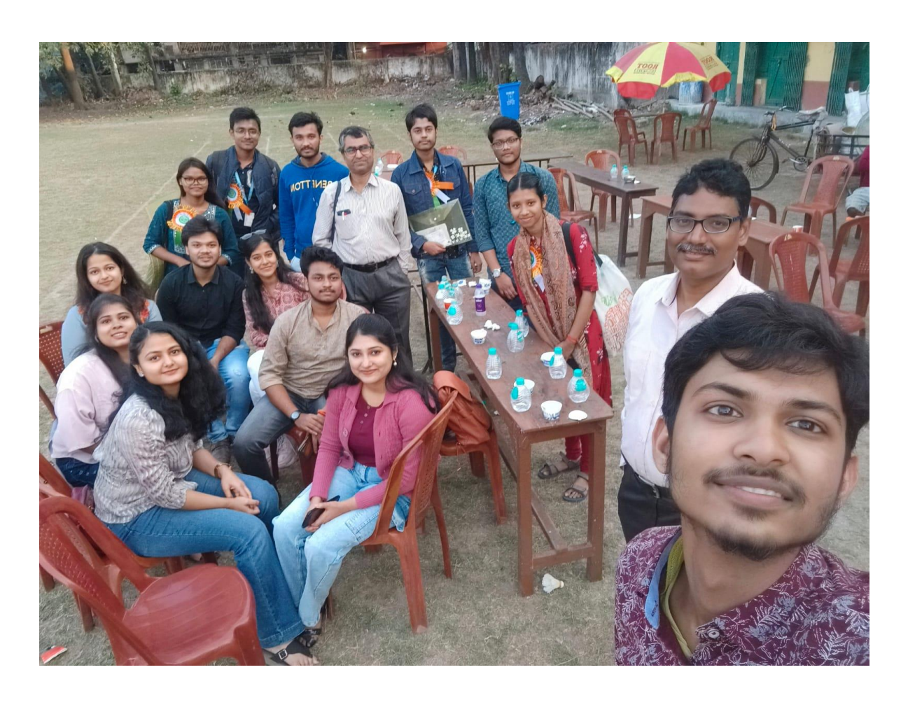
Small Group Photo