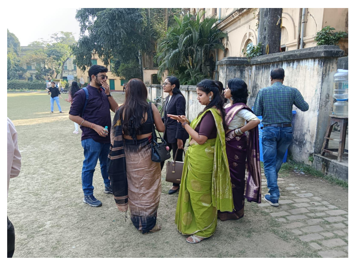
At the end