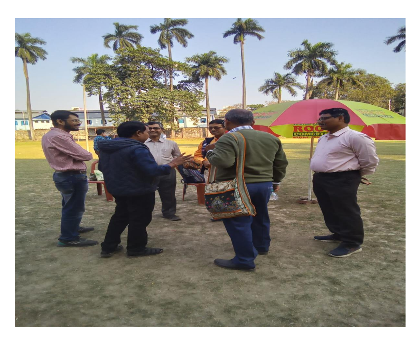
Interaction After Lunch