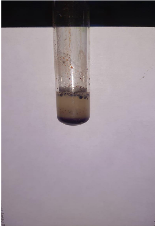
Molisch Test proved the presence of Carbohydrate